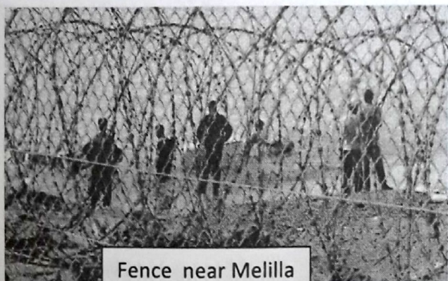
Fence near Melilla